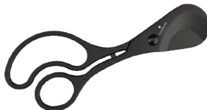
IN800 - BK1 Matte Black