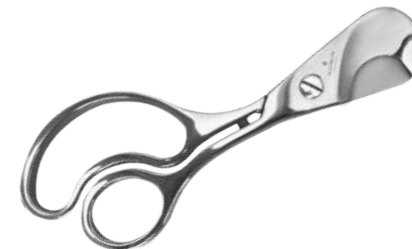
IN800 - SL Glossy Silver