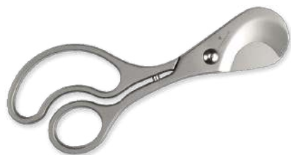
IN800 - GR Matte Silver