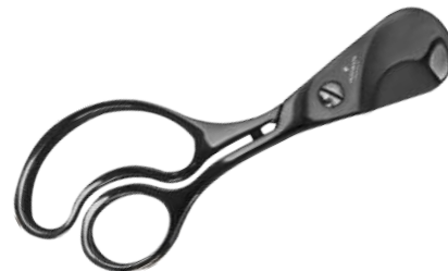
IN800 - BK2 Glossy Black - not available yet -